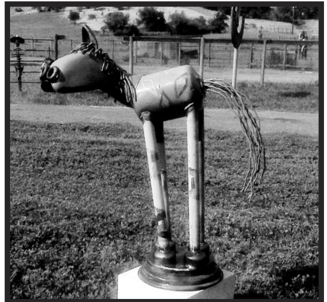
This whimsical painted metal horse, inspired by a drawing by Twila Van Damme, was created by renowned sculptor Phillip Glasshoff for the 2009 Vine Village auction