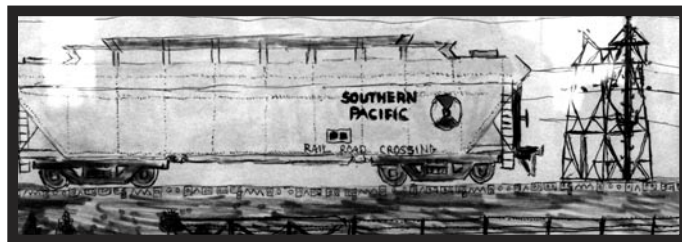
Pen & Ink by John Gallagher

While most Vine Village residents go out to work and/or day programs, up to 20 developmentally disabled people from the Napa community come to participate in the Vine Village Day (Arts-Based) Program.