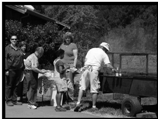
Clients and staff all enjoyed the Summer's End Barbecue Picnic held on a sunny day this September

Thanks to our Committee for all their dedication and hard work! And thanks to all who came and supported Vine Village at the event!