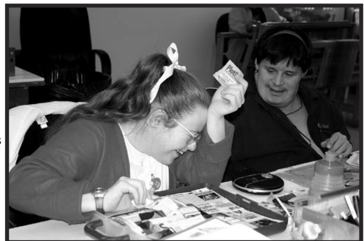
Vine Village Arts clients at work

Allstate Foundation - $500 grant in April 2007